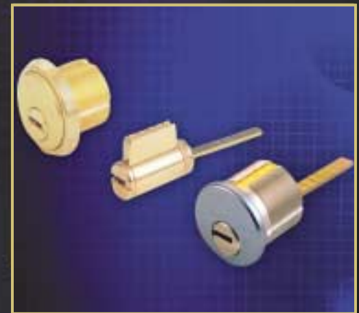
RETRO-FIT CYLINDERS IMPROVE ANY LOCK