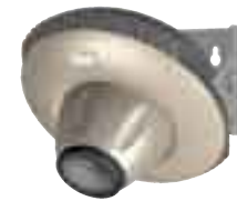
Easy-to-install wall mount