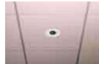
Concealed ceiling mount